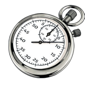
One million seconds