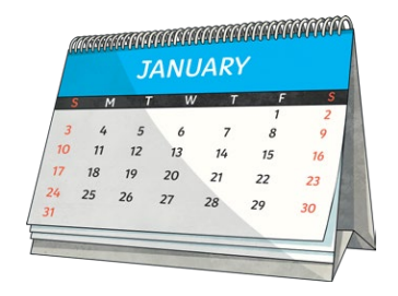
The month of January