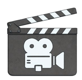
Length of your favourite film