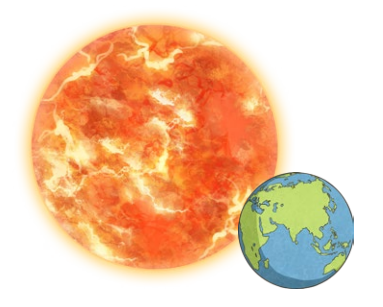
Time for the Earth to orbit the Sun