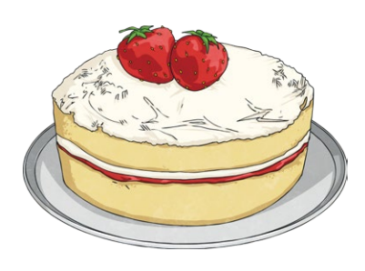
Time taken to bake a cake