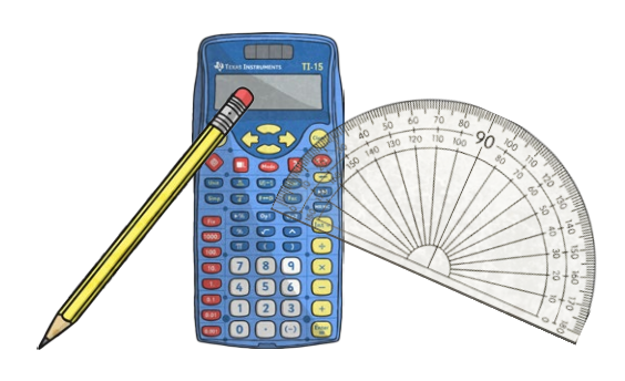
A week's worth of maths lessons