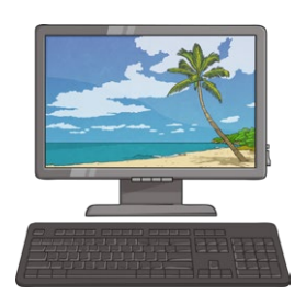
Time taken for a school computer to turn on